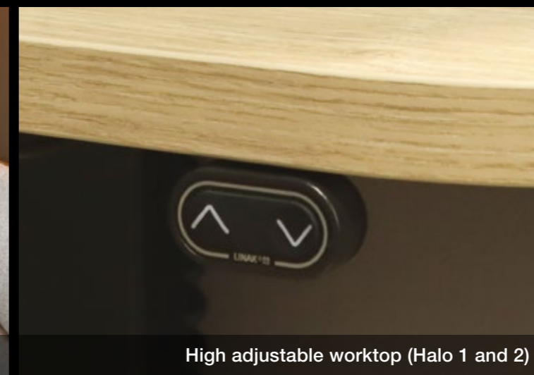
High adjustable worktop (Halo 1 and 2)