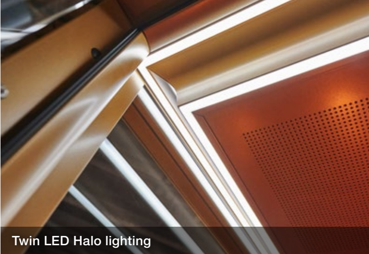
Twin LED Halo lighting